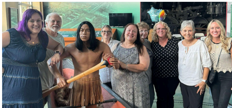
Kalama Chamber Banquet Organizers