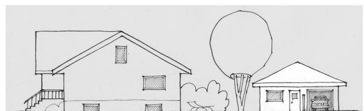
Garage suite (adjacent)