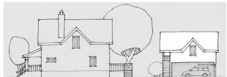
Garage suite (above)