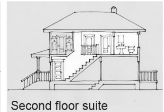
Second floor suite