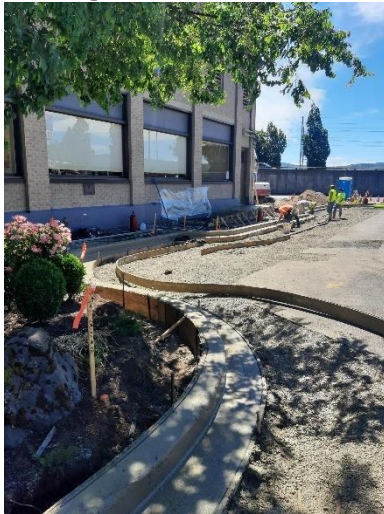
1 Before curb, sidewalk, & ADA ramp

The City is happy to announce the parking lot behind the City Hall building should be substantially complete by the time of this mailing, and the extension of sidewalk along NE Frontage Rd is nearly finished as well. There are also 7, angled, on-street parking spots that have been added to the downtown area along Fir Street as a result of this project. Thank you Clark & Sons Excavating, Inc. for your diligent work. The project is wrapping up; striping and ADA ramp railing will be done soon! We appreciate the understanding of the nearby residents and businesses. Thank you for your patience throughout the duration of this project.