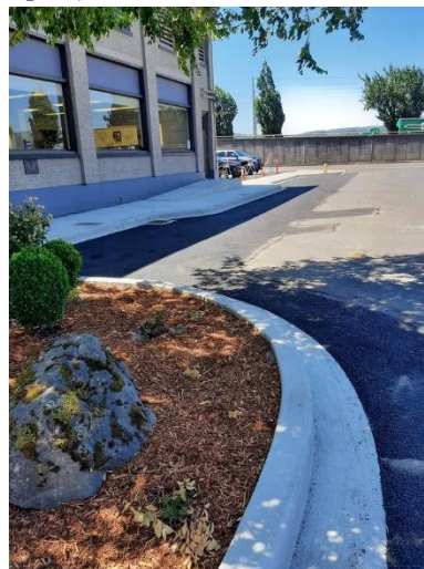
2 After curb, sidewalk, & ADA ramp