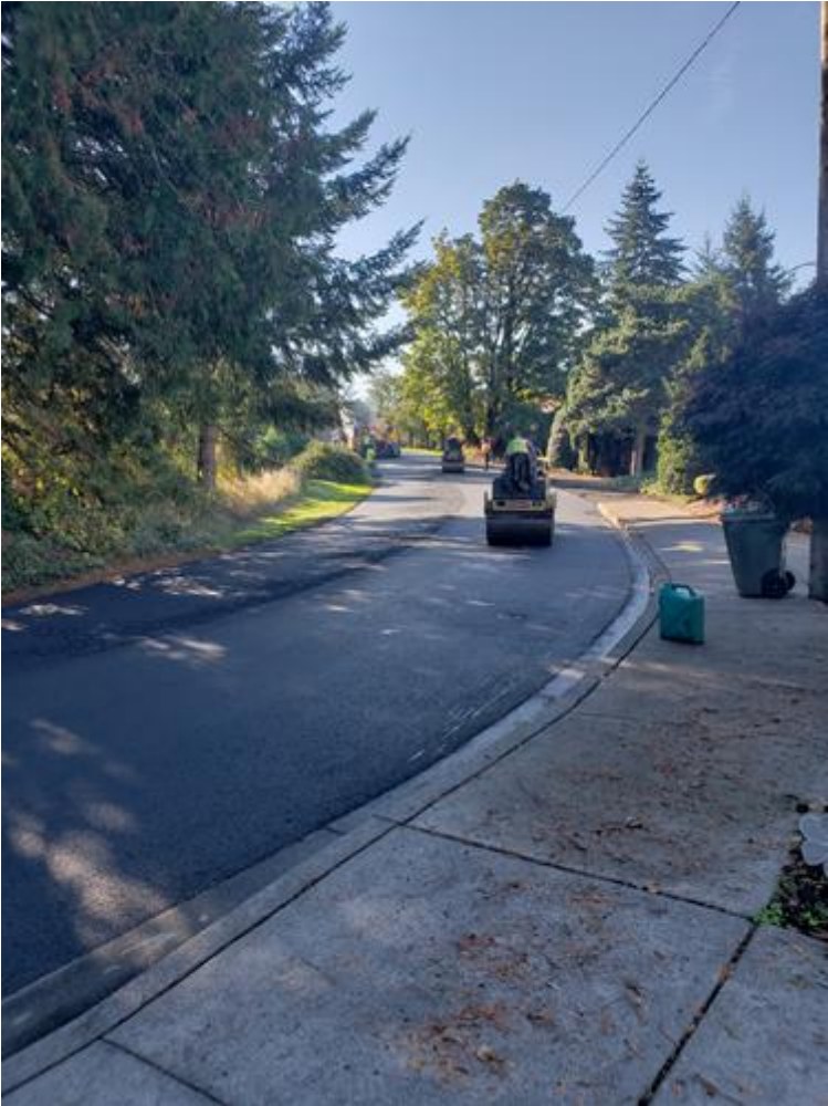
Summit & Wooddale – 2018 - $63,677